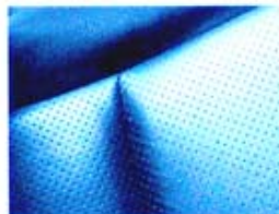
BLACK LEATHER MX-5 Miata LS