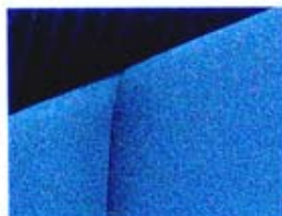
BLACK CLOTH MX-5 Miata